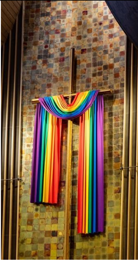
1 Rainbow Cross - Trinity United Church, Edmonton, AB