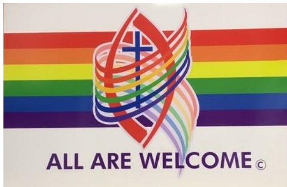
7 Knox United Church, Fort Frances, ON