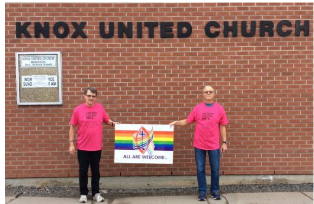
8 Knox United Church, Fort Frances, ON