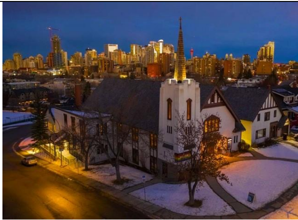
5 Scarborough United Church, Calgary, AB