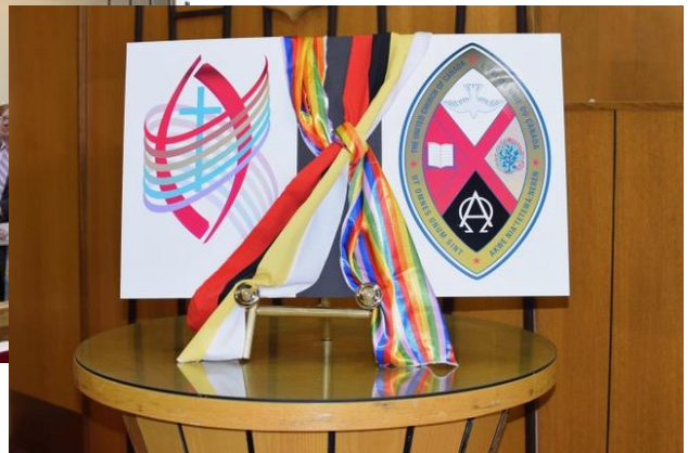
4 Trinity United Church, Edmonton, AB