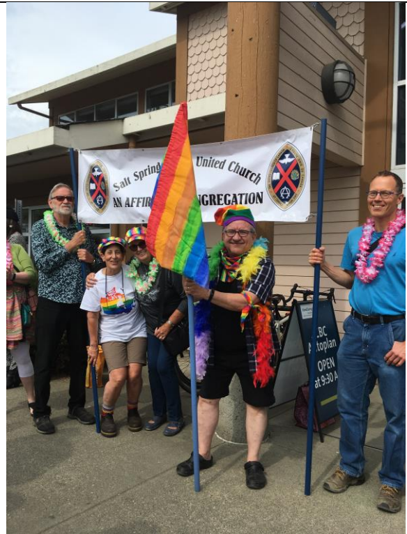
6 Salt Spring Island United Church, BC